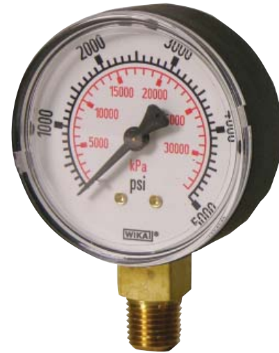
Bourdon Tube Pressure Gauge Type 111.10

Additional error when temperature changes from reference temperature of 68°F (20°C) ±0.4% for every 18°F (10°C) rising or falling. Percentage of span.