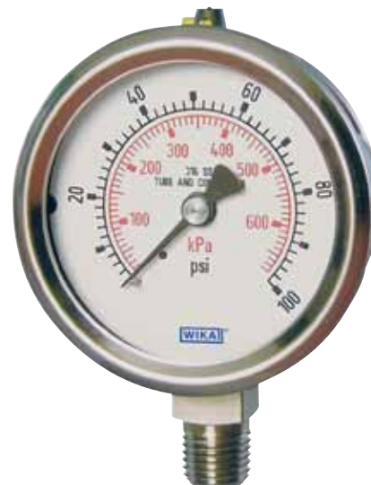
Bourdon Tube Pressure Gauge Model 232.53

Ambient: -40°F to +140°F (-40°C to +60°C) - dry -4°F to +140°F (-20°C to +60°C) - glycerine filled -40°F to +140°F (-40°C to +60°C) - silicone filled Medium: +212°F (+100°C) maximum