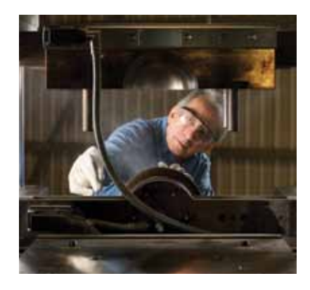
Quick turnaround and highest quality are assured by Parker's lean manufacturing principles and state-of-the-industry processes.

You can depend on Parker's unmatched strengths in: